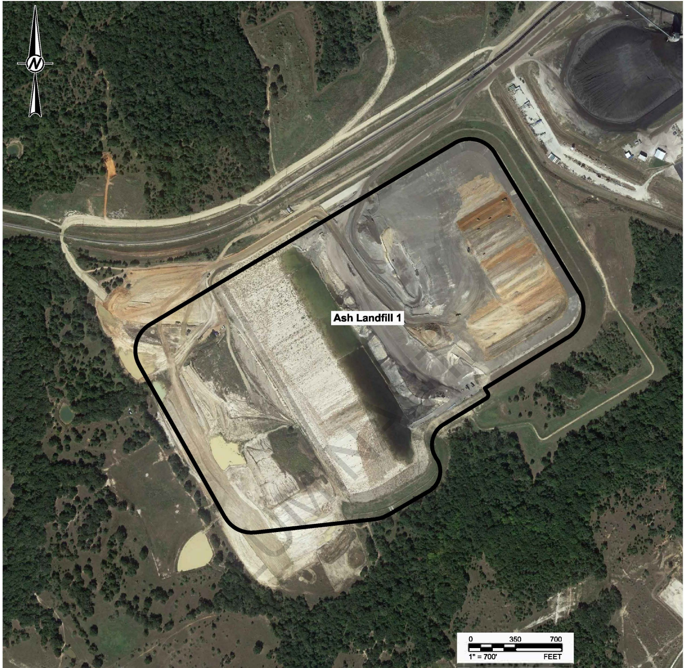
Ash Landfill 1